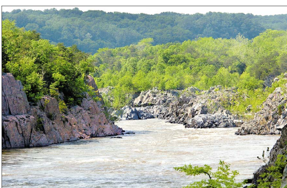
Unlike Potomac Gorge, Mather Gorge, above, is on the map. It extends for about a mile just below Great Falls.

He doesn't call it a gorge. His students don't call it a gorge. But they all agree it's gorgeous.