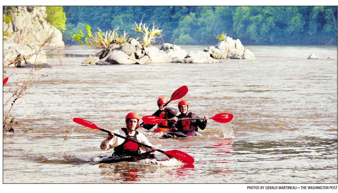
The view from the bottom: Kayakers on the Potomac have the best perspective to take in the grandeur of the gorge.

Next Week: Love the Tiny Tail Stain! or Naively Hint at Toilets